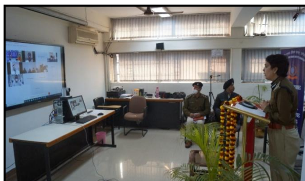
Dir CDTI Chd addresses the inaugural session of investigation of Financial Frauds and Money laundering Crimes. (Exclusively for Sri Lankan police officers)