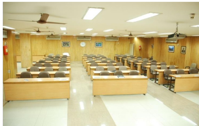
Classroom, CDTI Chandigarh