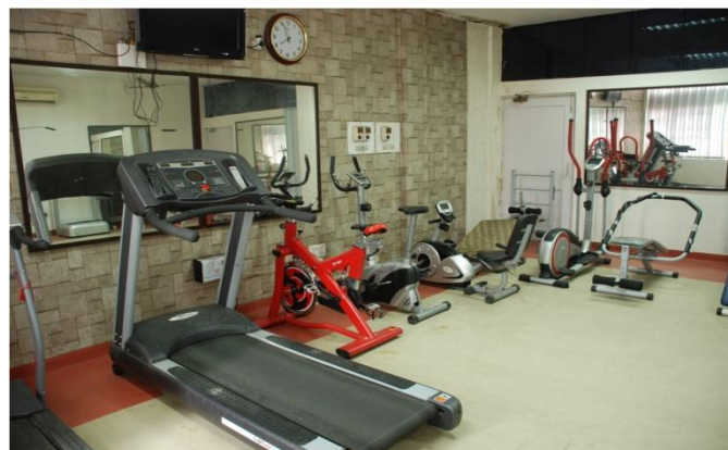
GYM at CDTI Chandigarh