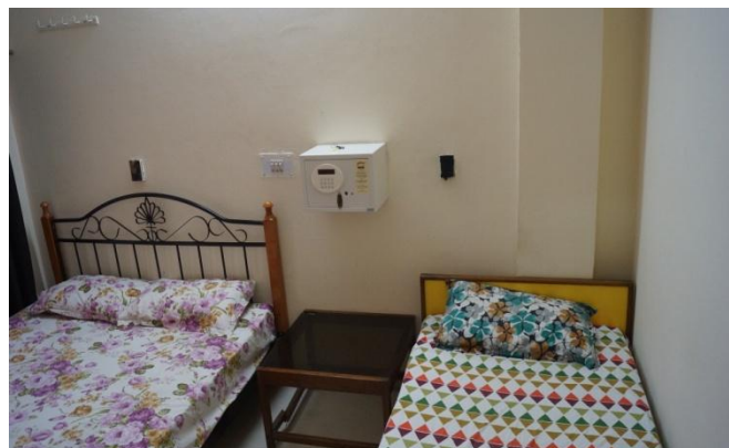
Hostel Room at CDTI's Campus Chandigarh